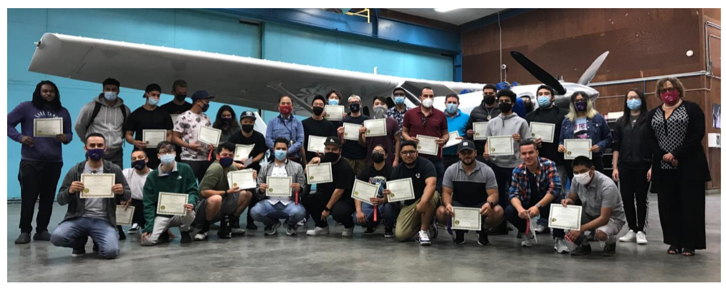
Class of 2021 Aviation Maintenance Technology students soon to embark on their life time journey as aircraft technicians.