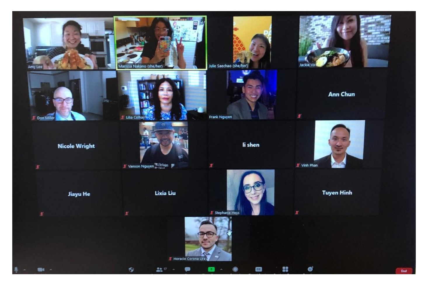
Screenshot of AAPI event: "Comfort Food for Crazy Times: 1UP Your Ramen Game"