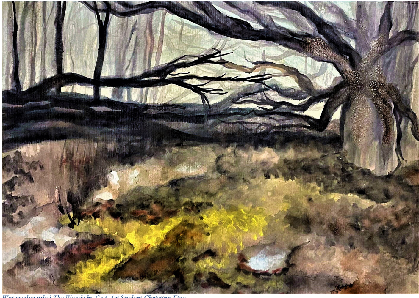
Watercolor titled The Woods by CoA Art Student Christina Fine.