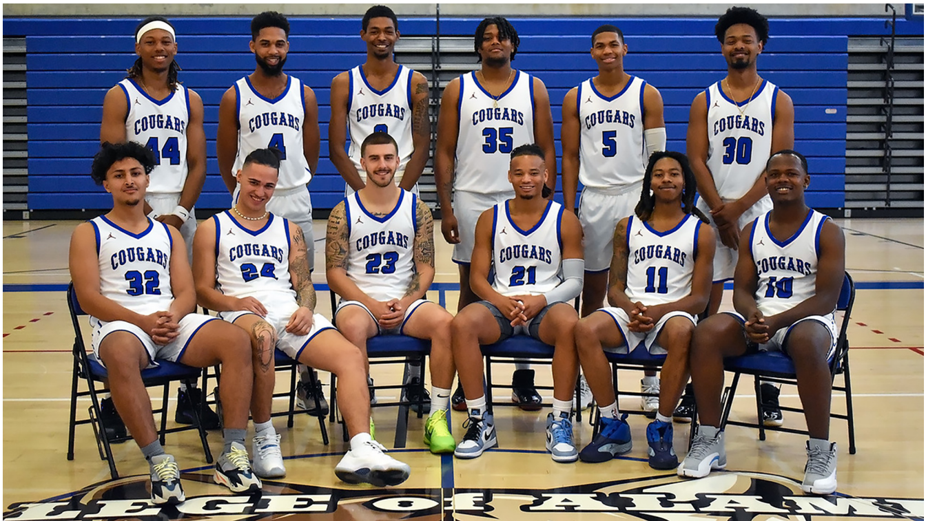
CoA's Men's Basketball Team is all smiles anticipating their first home game on November 13