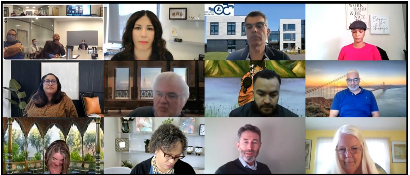
CoA’s HyFlex format Educational Master Planning Forum, held May 5, 2022, included on-campus and virtual participants.