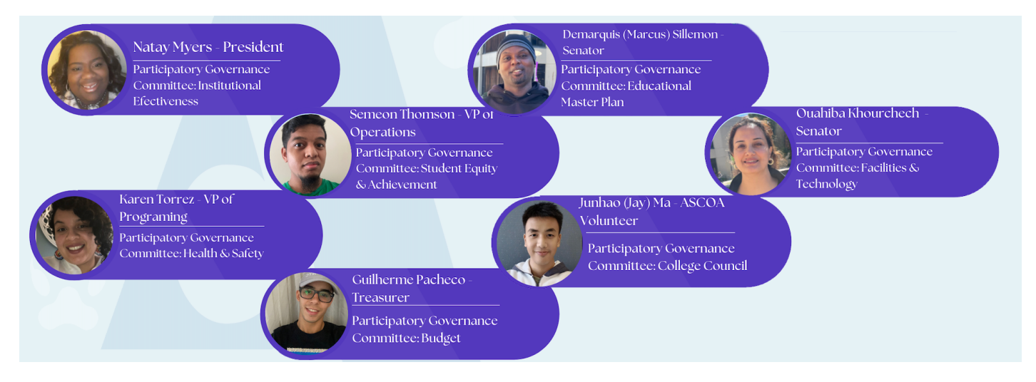
The Associated Students of College of Alameda has a full roster of Senators this fall!