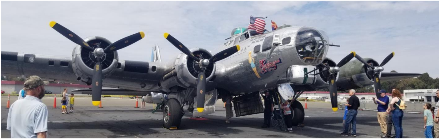
Families lining up to tour the inside of a WWII commemorative B-17 bomber aircraft