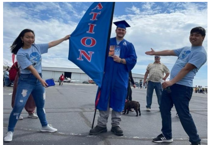
CoA AMT students walking in the event promoting the AMT AA /AS Degree Program.

Following a three-year hiatus due to the pandemic, the event had a great turnout, with about 2000 visitors. There were several airplanes and helicopters in various shapes, sizes, and styles on display, and even first responder tactical vehicles to climb on. And the most monumental spectacles were the B-17 and B-25 bomber aircrafts. Two of our students were given a free flight ride on a Cessna around the Bay. A few CoA AMT alumni, who are now working in the industry, stopped by to share their work experiences with our current students. All attendees seemed to feel great enthusiasm and excitement for this interactive, informational, and fun filled event.