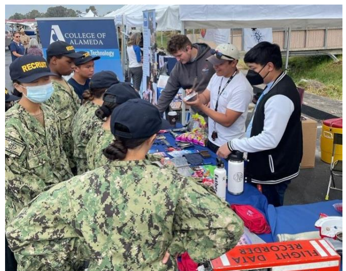
CoA AMT students demonstrating sheet metal riveting to Navy League Cadet Corp students