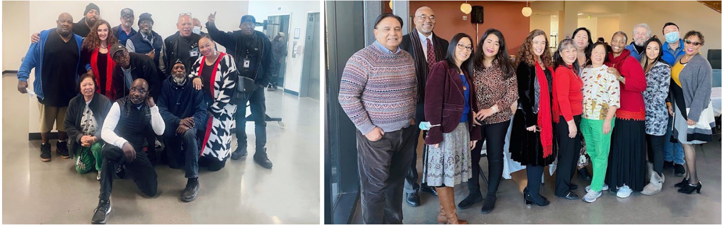
College of Alameda faculty, staff, and administrators kicked off the holiday season with an on-campus luncheon on December 7, 2022.