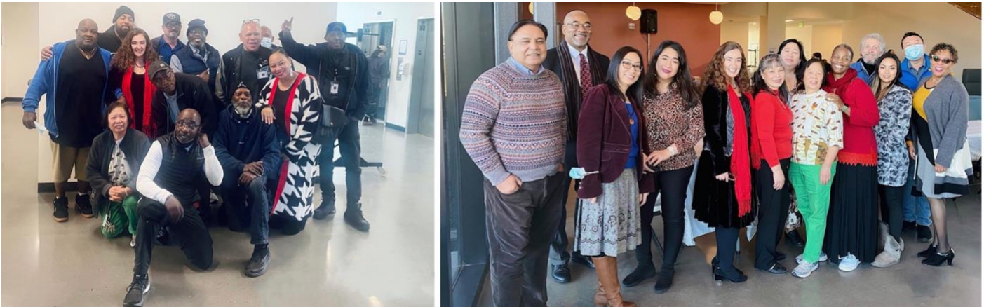
College of Alameda faculty, staff, and administrators kick off the holiday season at an on-campus luncheon on December 7, 2022, Building H

Help spread the word that CoA will be offering free classes and $500 on Us grants to qualified students for Spring 2023 semester. For details at https://alameda.edu/FreeSpringPlus500OnUs/ . For more information students may call (510) 295-073, email COA500@peralta.edu , or visit the Virtual Welcome Center Mondays from 8 a.m. to 7:30 p.m. and Tuesdays through Fridays, from 8 a.m. to 4 p.m. on Zoom https://us06web.zoom.us/my/coa500 .