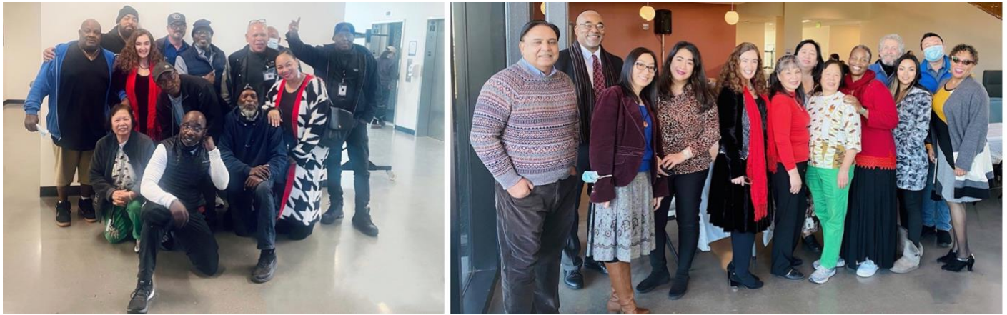
College of Alameda faculty, staff, and administrators kicked off the holiday season with an on-campus luncheon on December 7, 2022.