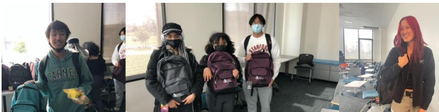
Delighted College of Alameda Promise Students show off the new backpacks that they received at the recent Financial Aid Workshop