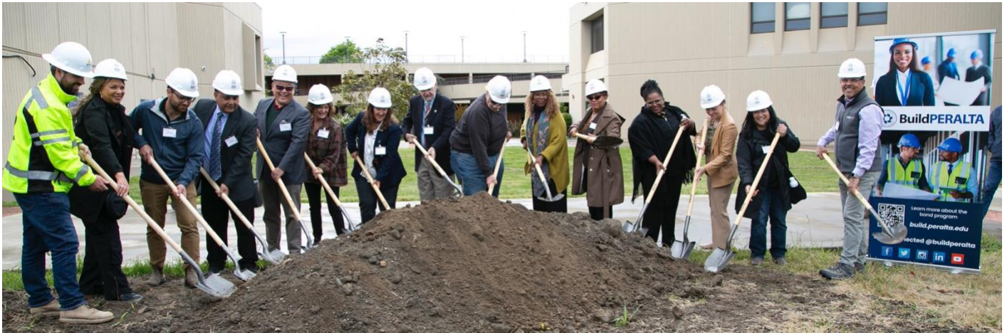
College and District representatives broke ground for CoA's New Transportation Technology Center (NTTC) for Auto Diesel Programs, on Wednesday, May 3, 2023.