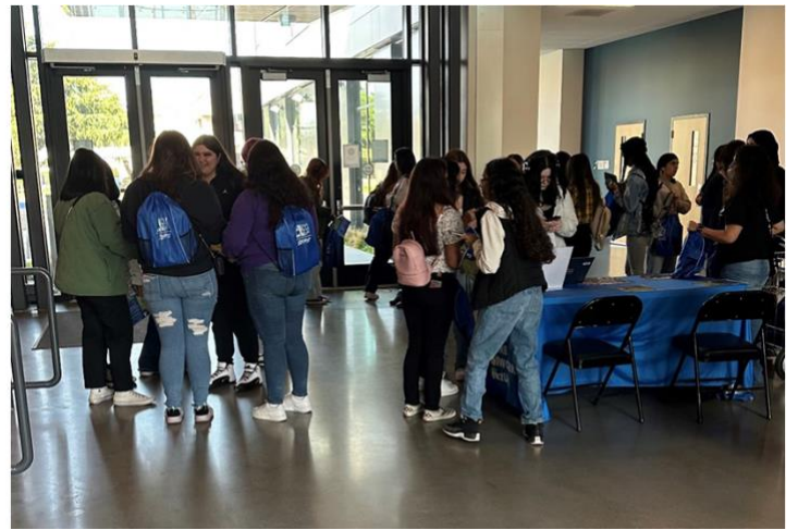
Photo: San Leandro High and Lincoln High Schools students and staff visit CoA on April 25, 2023.