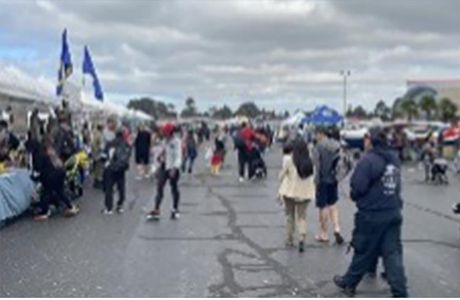
College of Alameda Aviation Maintenance Technician Program students, faculty, and staff hosted a booth at the annual Hayward Airport Open House on September 24, 2023. The event boasted an impressive turnout, drawing in over 7,500 attendees and transforming the airfield into a bustling hub for aviation enthusiasts and families.