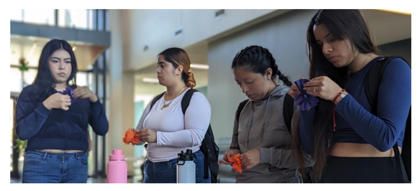
CoA's first Latinx Heritage Month event showcased tissue paper crafts, including papel picado and paper flowers.