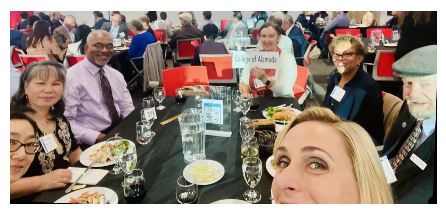
On September 28, 2023, College of Alameda representatives attended the Alameda Economic Forecast event.