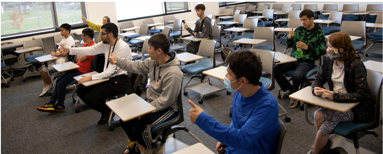
Photo: Students Participate in CoA's National Disability Employment Awareness Month (NDEAM) event in October.