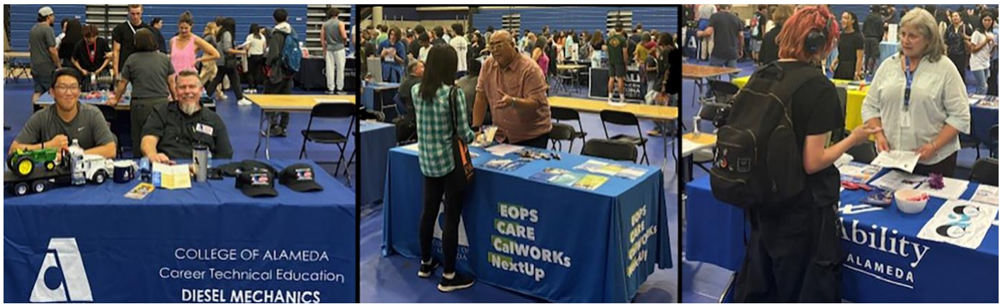
Representatives from various CoA academic programs and services played an essential role in the 31st Annual Citywide College Night