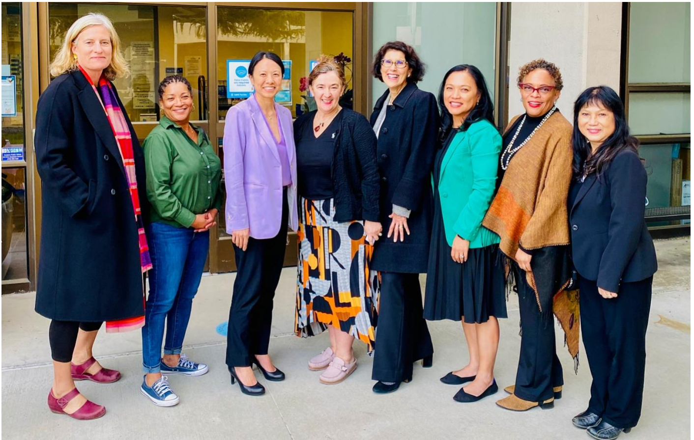
Leadership Unites: Stakeholders from Alameda City, Asian Health Services, and College of Alameda come together to discuss and strengthen their partnership for a healthier and brighter future.