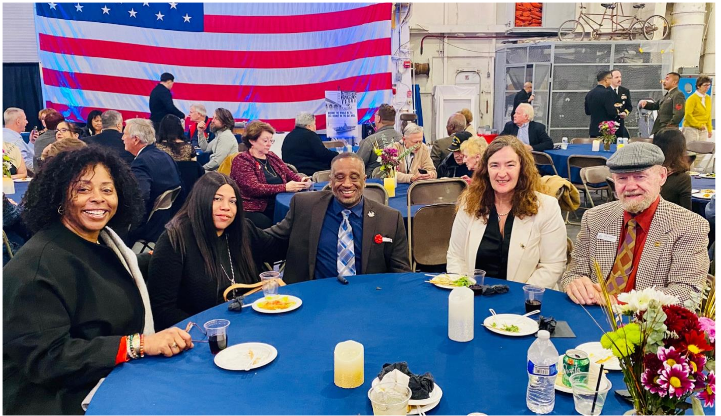
A College of Alameda team celebrates Veteran's Day as part of the USS Hornet Sea, Air & Space Museum's Silver Oak Anniversary.