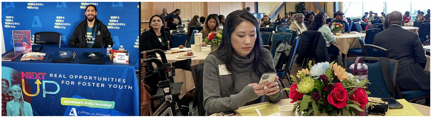
Photo left: COA's information table at the Care 2 College Conference held at CSUEB. Photo right: conference participants enjoy lunch.