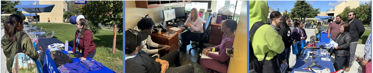
Photos from left: Acceso team greets students. Counselor meets with family members, and Aviation Program engages to students.