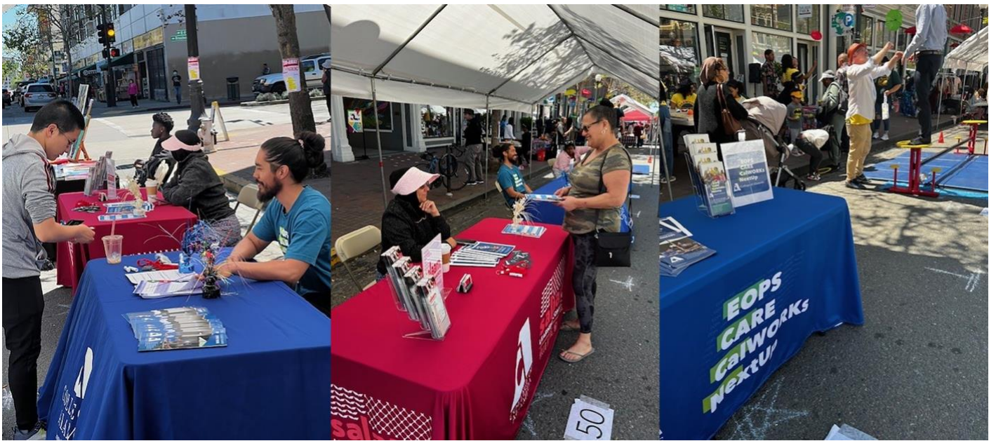
EOPS, CARE, CalWORKs, Next UP, and SALAAM team members participate in the 5th Annual Oakland Creative Expo.